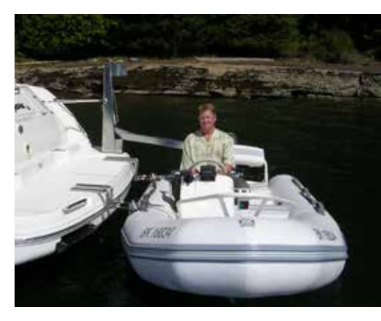
The safest and easiest way to raise and lower your dinghy.